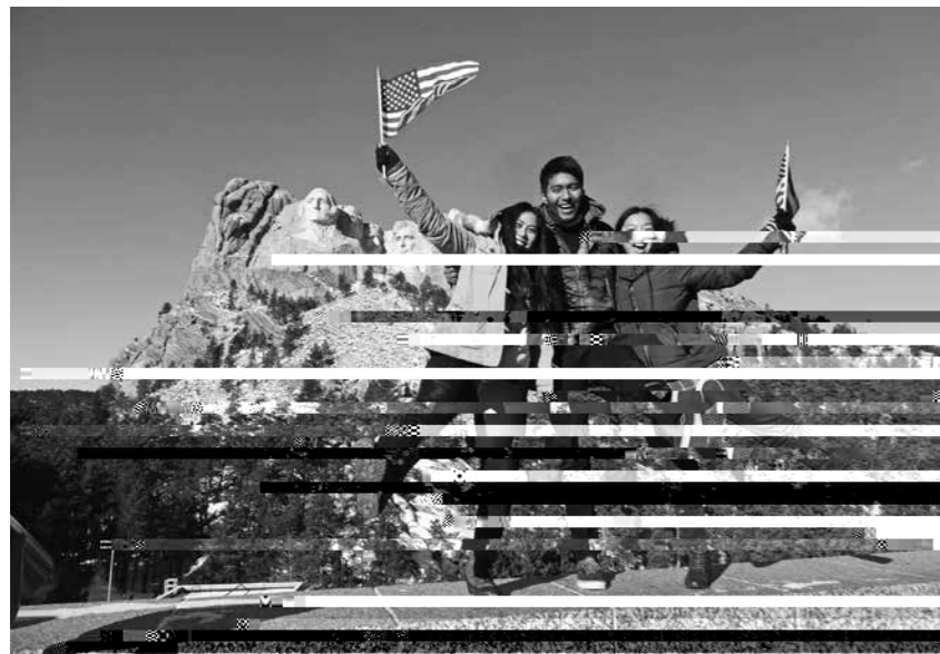
More than 1000 UQ students participated in UQ's international exchange program. (Caption text is partially obscured by a large, faint watermark in the original image.)